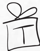
trial or temptation